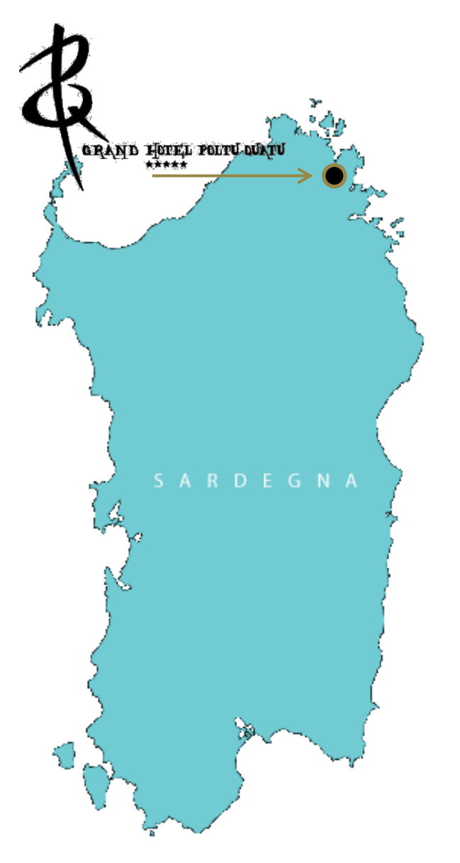
Olbia Costa Smeralda Airport Grand Hotel Poltu Quatu 35 Km – 45 Minutes by car

Others - Riga, Oslo, Copenhagen, Prague, Wien, Stockholm, Bratislava, Gotheborg, Katowice, Poznan, Warsaw, Salzbourg, Lisbon.